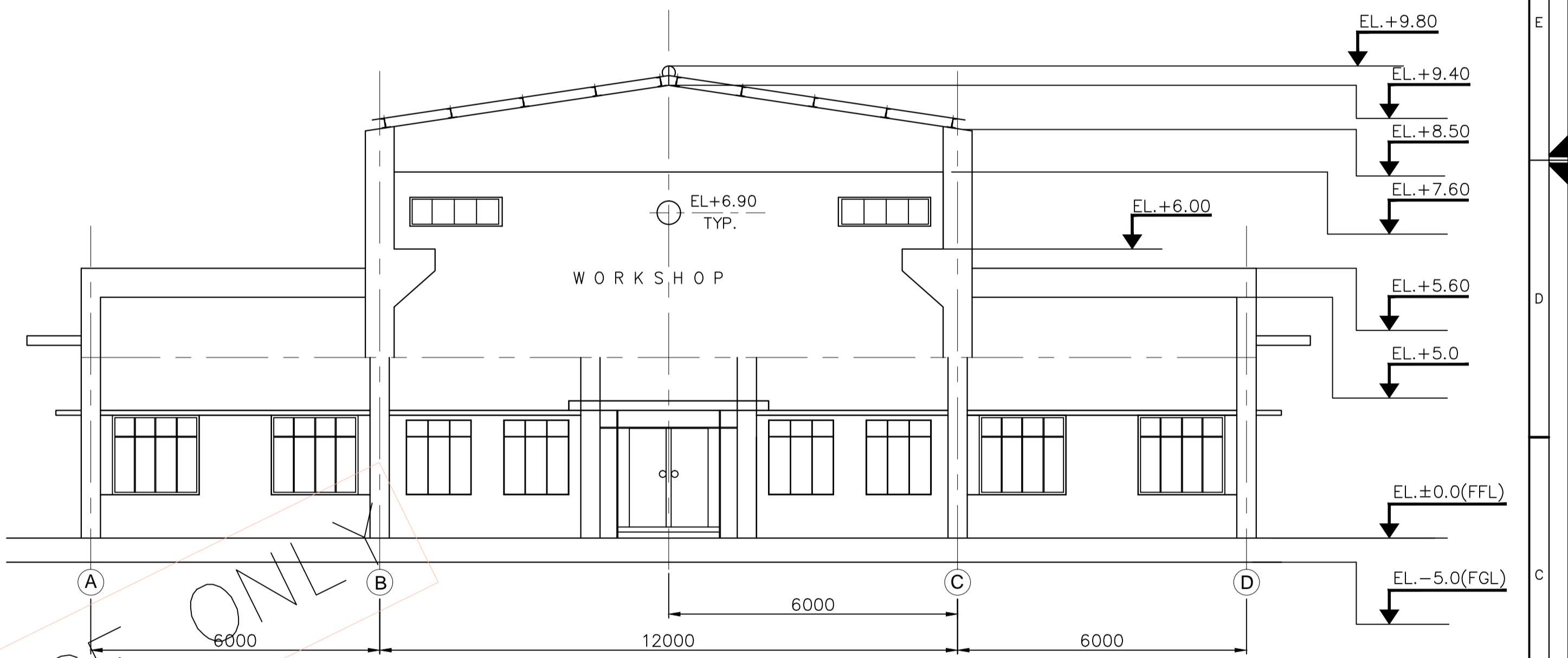
EAST SIDE ELEVATION SCALE - 1:80